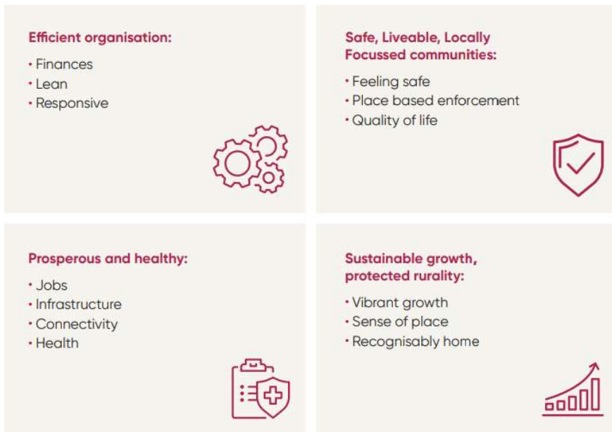
Figure 1.2: North Warwickshire's Corporate Plan Key Visions.

The Corporate Plan aims to protect the rurality of North Warwickshire, support its communities and promote the wellbeing of residents and business. To achieve this, the Plan sets out four key visions, which it aims to deliver (illustrated below).